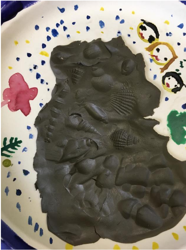
2 nd grade fossil project.