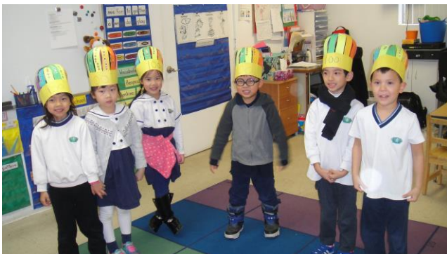
Kindergarteners wear their 100 days hats.