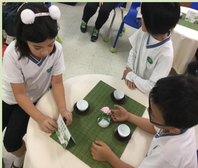
A few of our first graders during the first Tea Ceremony of the month. The students talk about manners and food etiquette with the sisters who volunteer from the foundation.