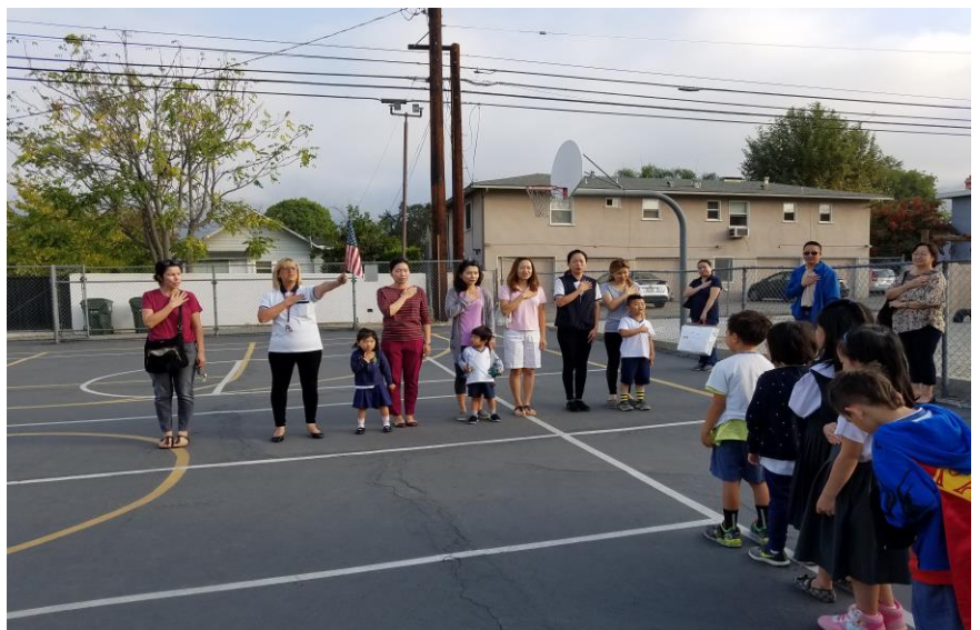
Some parents volunteered to help with the Pledge one morning!

In Peace, Ashley Grover Acting Principal